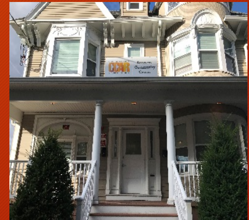
1435 Chapel Street New Haven CT 06511