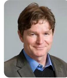
John F. Kelly