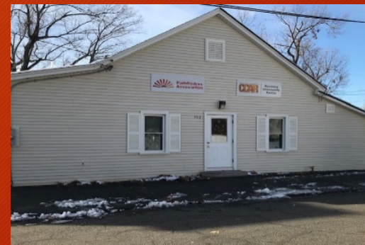
102 Norman Street Manchester, CT 06040