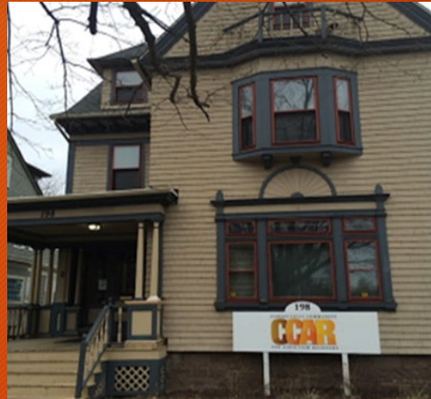
198 Wethersfield Ave. Hartford, CT 06114