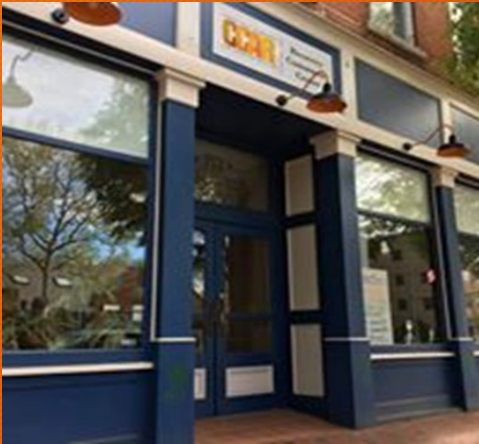
713 Main Street Windham, CT 06226