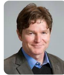
John F. Kelly