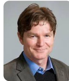
John F. Kelly